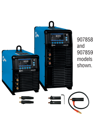
907858 and 907859 models shown.

Order machine only or use a single stock number to order a complete preconfigured system.