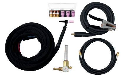
301268 kit shown.