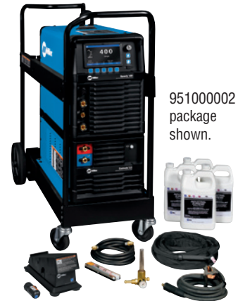
951000002 package shown.