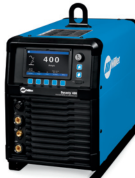
Dynasty 400 machine only

Allows for any input voltage hookup (208–600 V) with no manual linking, providing convenience in any job setting. Ideal solution for dirty or unreliable power.