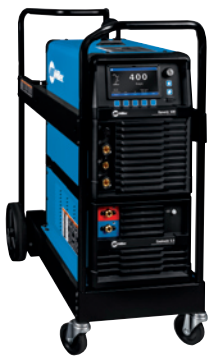
907858001 Dynasty 400 TIGRunner® shown with four bottles of 043810 Low-Conductivity Coolant.

Select desired stock number for each step.