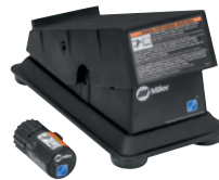
301580 remote shown.