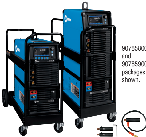
907858001 and 907859001 packages shown.